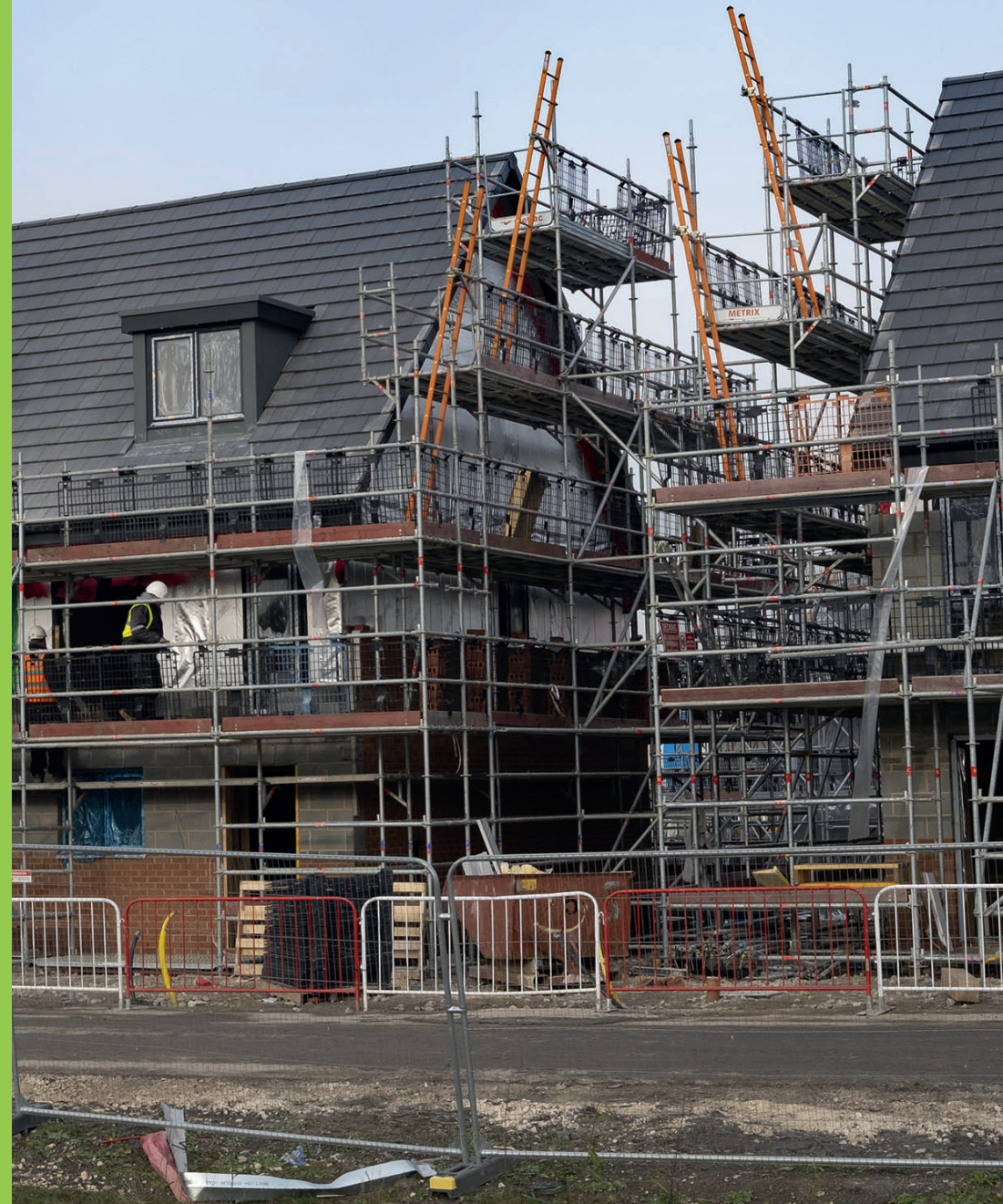
Building energy efficient homes