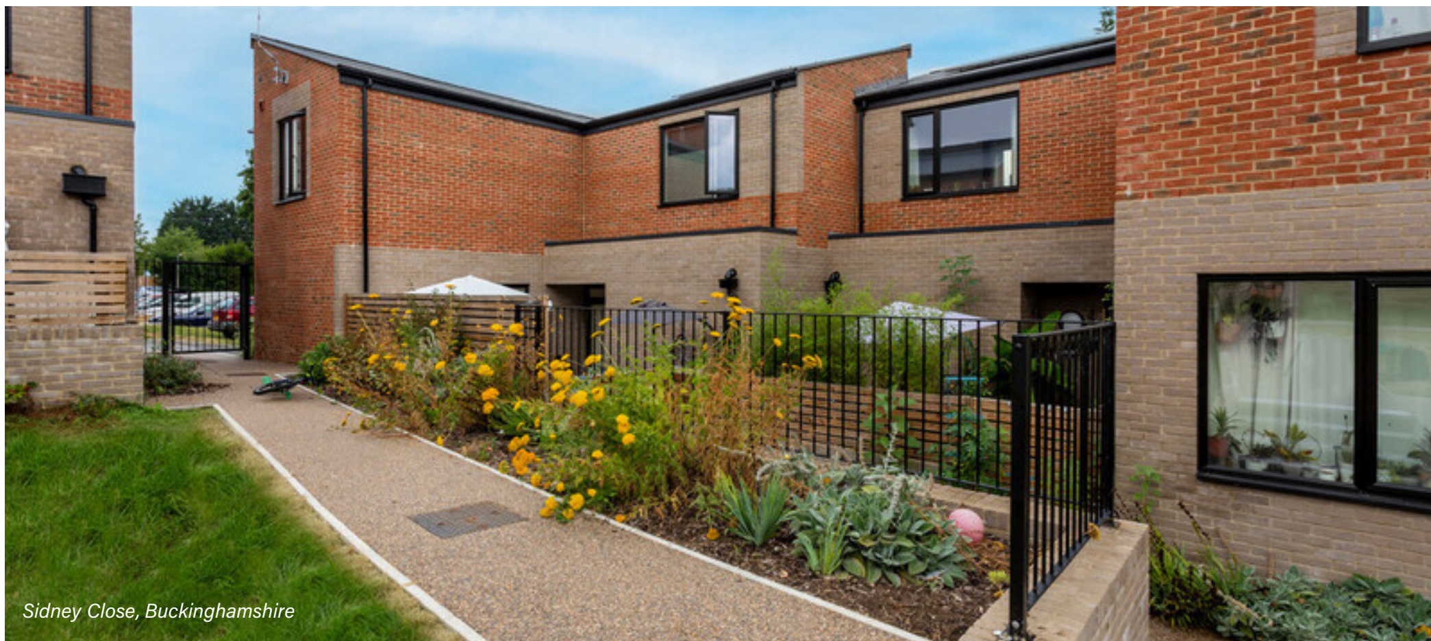
Sidney Close, Buckinghamshire