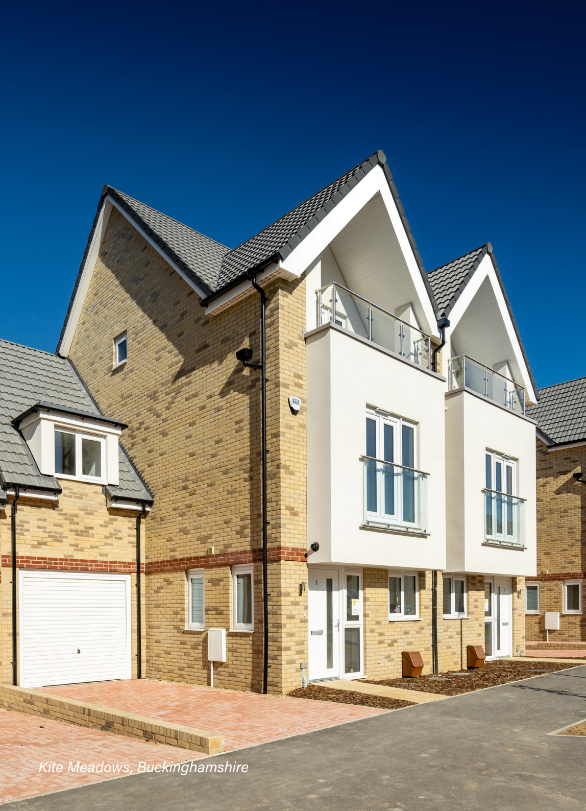
Kite Meadows, Buckinghamshire

We are a thriving county, but like many other places within the UK, this creates challenges for people looking for housing. Buckinghamshire has house prices and rents which are higher than the English average.