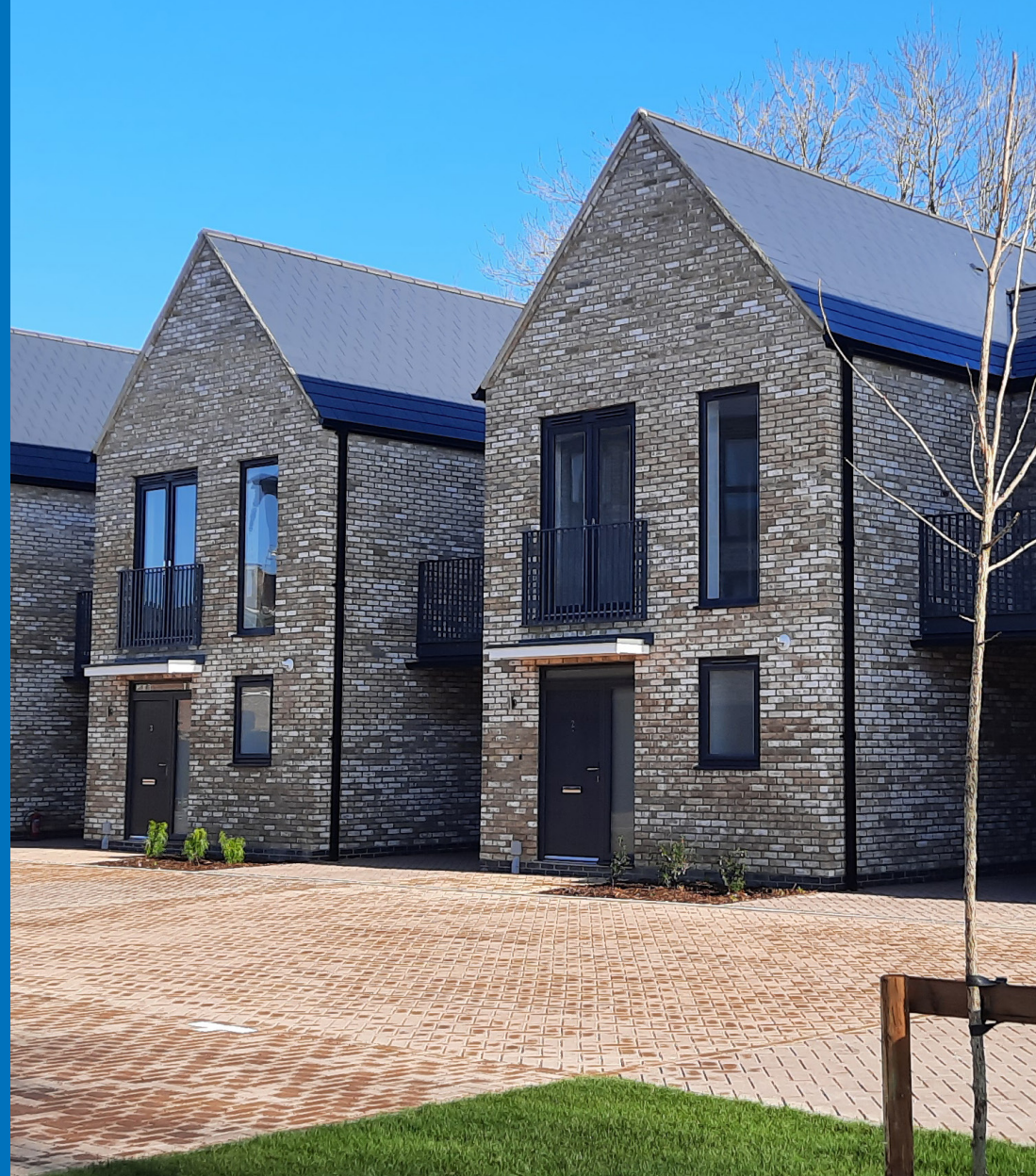
Queensmead Road, High Wycombe, Buckinghamshire